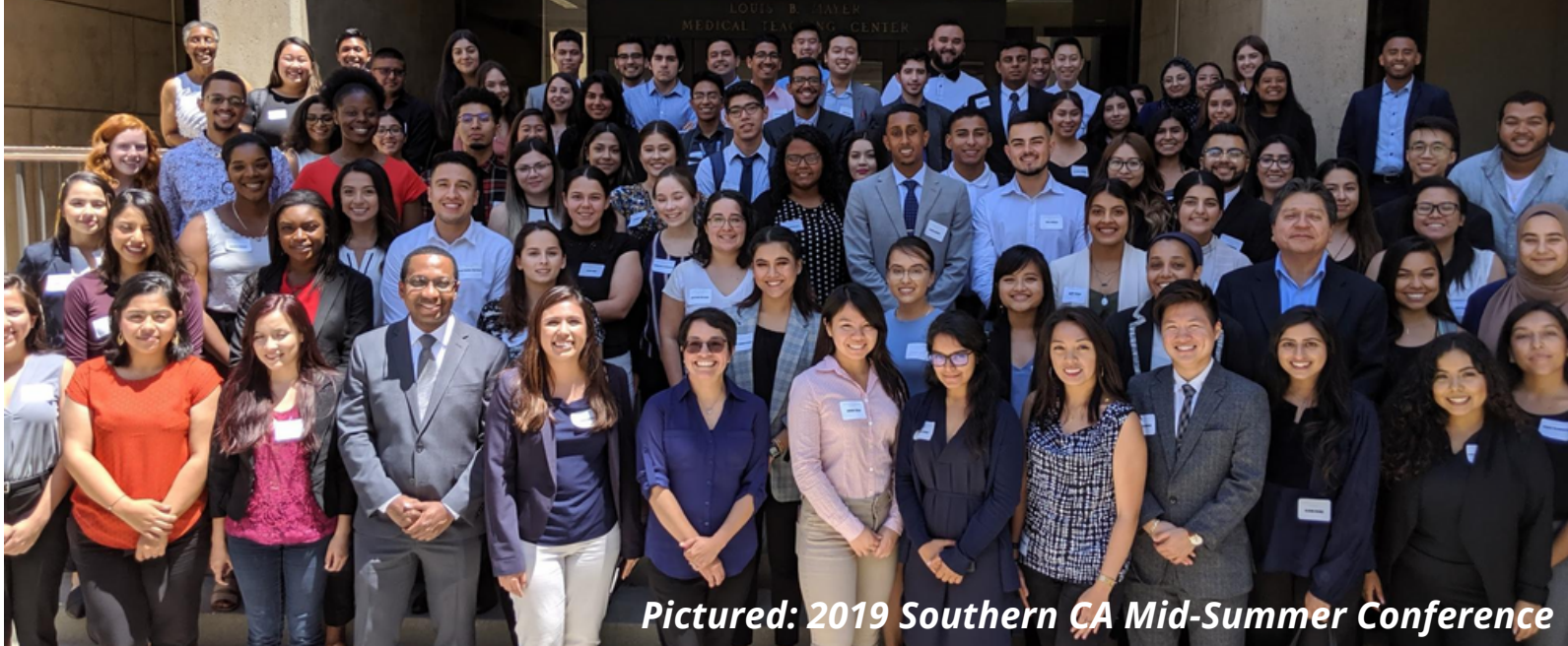
Pictured: 2019 Southern CA Mid-Summer Conference