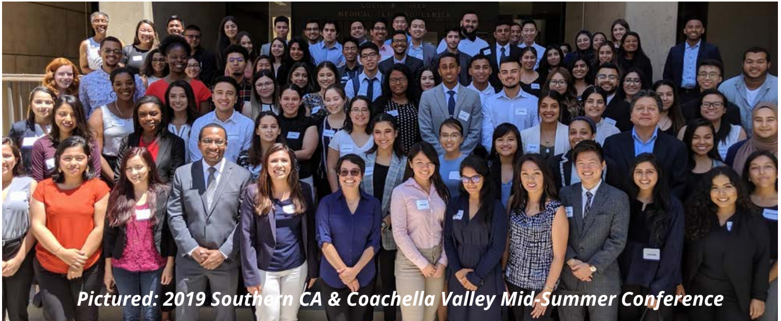
Pictured: 2019 Southern CA & Coachella Valley Mid-Summer Conference

HCC thanks our HASC and CDIP partners for supporting our talented, diverse interns as they support your projects and identify their authentic medical careers. We look forward to continuing our partnership in developing our nation's next physician's, PA's, DNP's, Clinical Researchers, Social Workers and more. We thank all of the virtual workshop presenters for their expertise and look forward to meeting in-person when feasible! (Picture below, 2019 pre-pandemic.)