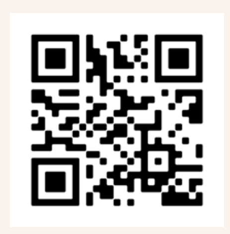
QR code to Online nominations page (download)

HASC hospital employees and community members may nominate heroes by using the online form at <a href="https://hasc.org/heroes">https://hasc.org/heroes</a> or scanning the QR code below. Nominations can also be made by emailing this PDF form and supplemental materials to mschh@hasc.org. Please post the form to your website and/or social media, or link to the file at <a href="https://hasc.org/PDFnominations">https://hasc.org/PDFnominations</a>.