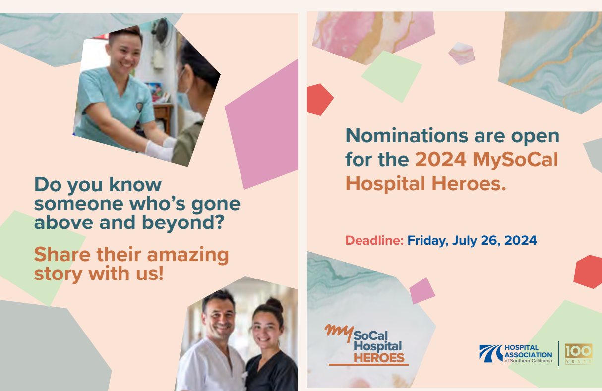
Social media carousel posts (download)

The awards will highlight the work of outstanding hospital workers in LA, Orange, Riverside, San Bernardino, Santa Barbara and Ventura counties. These staff, who can work in any area (clinical, administration, operations, volunteering and more), have notably impacted patients and coworkers. Awardees will be honored at the My SoCal Hospital Heroes Awards Gala, Saturday, Nov. 2, 2024. To learn more, visit https://hasc.org/heroes.