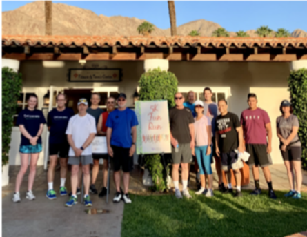
Runners in the HASC Fun Run